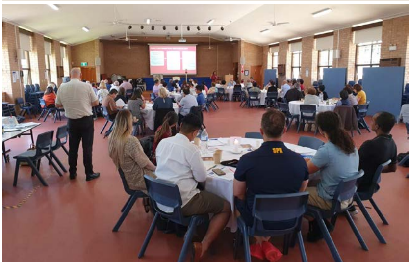
Final Parish-in-Council of 2023 underway!