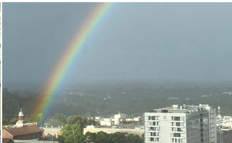
Thanks to JP for this fantastic photo of a rainbow that looks like it's coming out of our church!