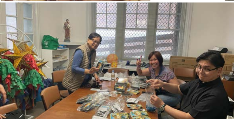
Making packs to accompany the St Pius X students on their immersion trip!