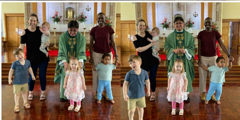
Our first kids and parents thursday Mass before playgroup!