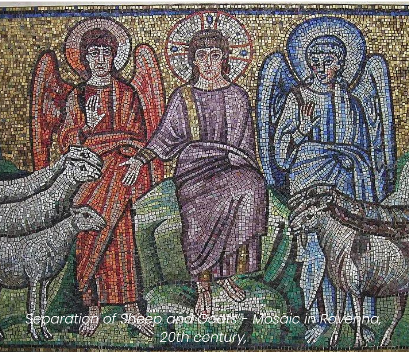
Separation of Sheep and Goats - Mosaic in Ravenna, 20th century.

He will take his seat on his throne of glory, and he will separate men one from another.